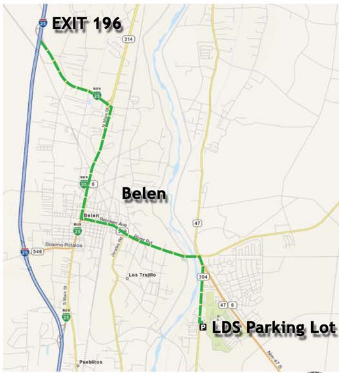
MAP TO RACE STAGING AREA